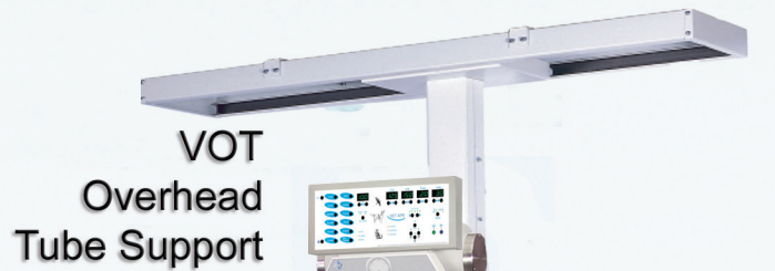
VOT Overhead Tube Support Handlebar APR Console

For those more demanding applications where 360 degree access is required and floor space must be clear, we have the system which utilizes the overhead tube support and elevating table with 4-way float top.