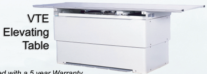
VTE Elevating Table