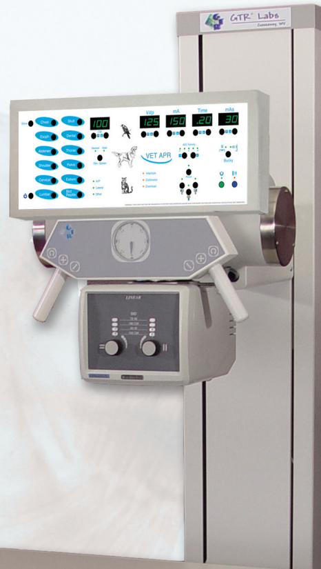
VTT Integrated Table/Tube Stand